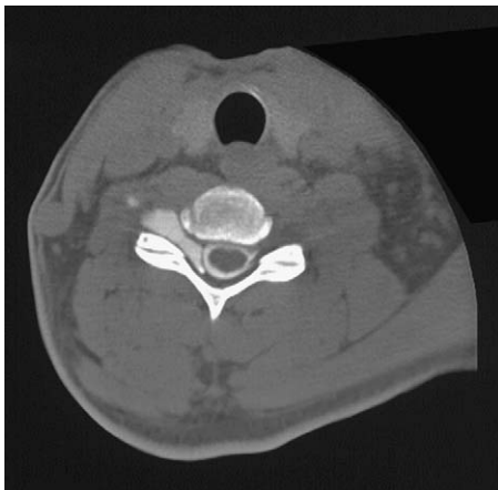
Fig. 2. CT myelogram of nerve root avulsion.

While reviewing the diagnostic data, the operative team needs to be organized, including making arrangements for intraoperative